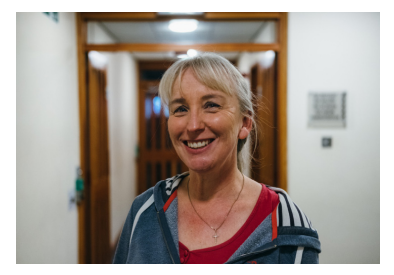
Vulnerable Adults' Safeguarding Officer

All reported concerns are escalated to the Diocesan safeguarding advisor for action or advice.